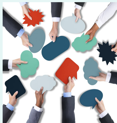
Image 4. The stakeholder workshop on the ICH E6 R3 public consultation will take place on 13-14 July 2023.

Further details on the workshop, including on the registration process and agendas, will be published on dedicated event page . Early registration is recommended to facilitate the planning and allocation of the breakout sessions especially.